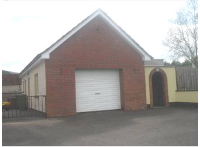
Large Detached Garage